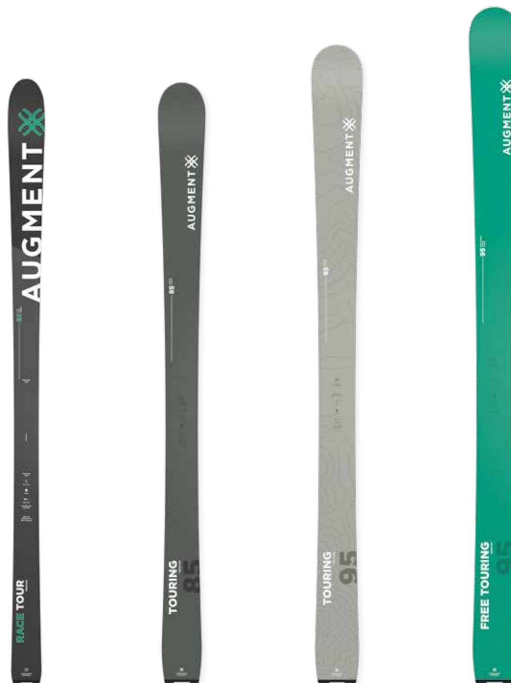
TOUR 65 RACE Carbon