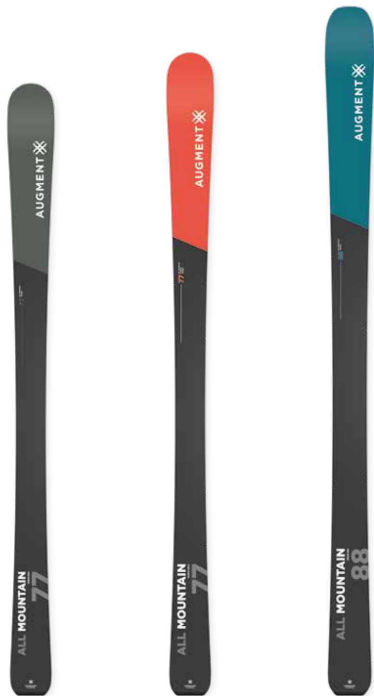
ALL MOUNTAIN 77 Titanal